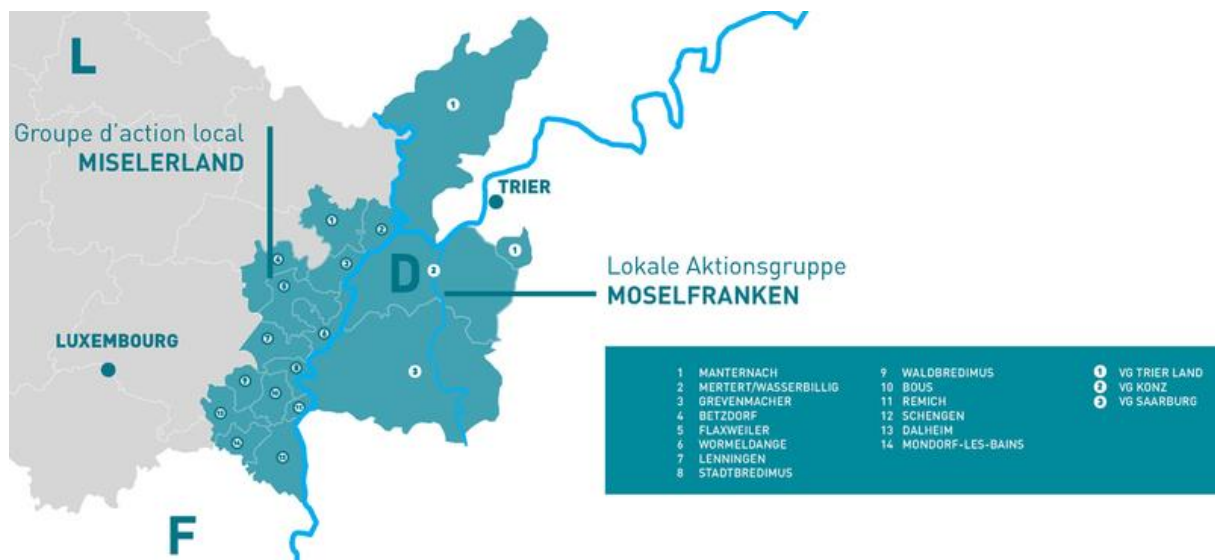
The territory of the first transnational LEADER region in Europe

Despite the proposal from the national level that in all German regional RDPs the provisions for simplified implementation of cooperation projects are taken up, the approach that a Managing Authority recognizes the conditions of the RDP, under which the lead LAG is supported, has not been introduced into the RDPs in all Bundesländer. One reason for this is the fear that own RDP resources could be spent in other RDP areas.